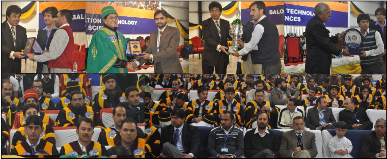
Employee of the Year Award winners in different categories at the ceremony.