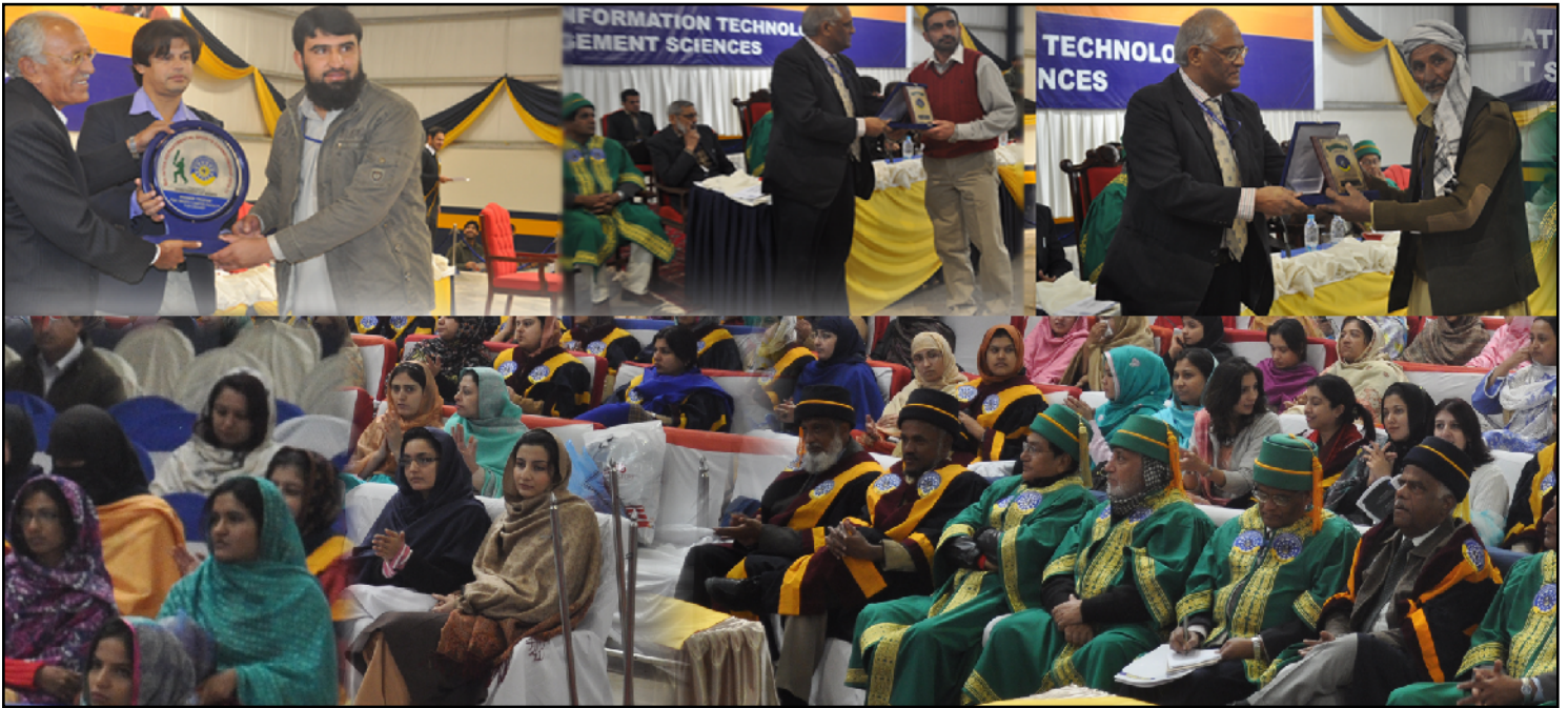
Award- winners receiving prizes at the Best Employee Award ceremony.