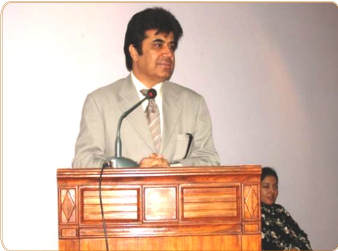
Vice Chancellor expressing his views.