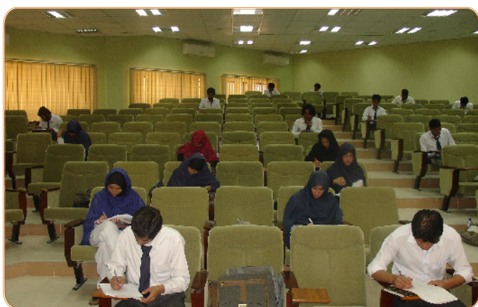
Essay writing competition in progress.