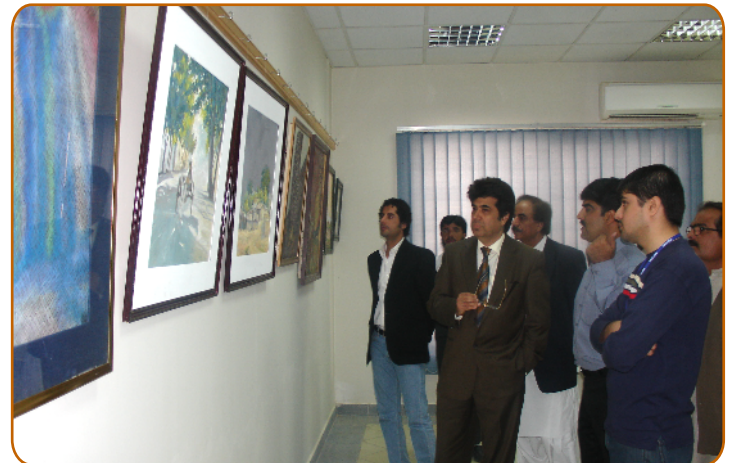
The Vice Chancellor watching the paintings.

A Painting and Graphic Arts Exhibition was held at the new Academic Block of Takatu Campus, BUIITEMS on October 25, 2010. More than 60 paintings by 30 renowned artists were on display in the exhibition. Vice Chancellor Engr. Ahmed Farooq Bazai, who is himself a great lover of art, inaugurated the exhibition, which was the first of its kind arranged by the Department of Fine Arts, BUIITEMS.