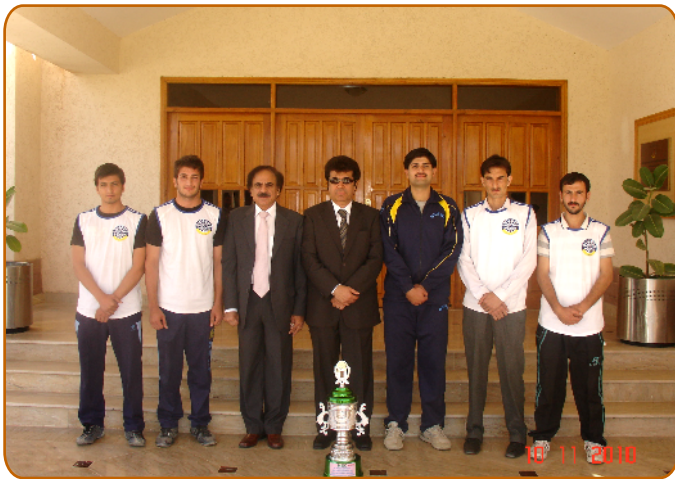
BUIITEMS Table Tennis players with VC & Pro VC

and secured first position in the zone. The last match of the tournament was between UoB and BUET Khuzdar. After a tough match BUET Khuzdar beat UoB by 2-1 and got second position in the tournament ZONE- I. BUIITEMS and BUET, Khuzdar qualified to play in the final round of the All Pakistan Inter University Table Tennis Tournament.