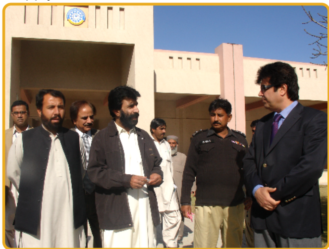
Federal Minister of state expressing his views.

Only then they would be acceptable in the job market. The Vice Chancellor referred to the large-scale absorption of BUIITEMS graduates in various fields of professional importance. He lamented at inadequate release of funds by the federal government that had put the university in difficulty and the five year future plan of BUIITEMS is hard hit by this situation. Everyone has to come forward in the noble cause of rescuing the educational institutions out of the quandary caused by the insufficient supply of funds.