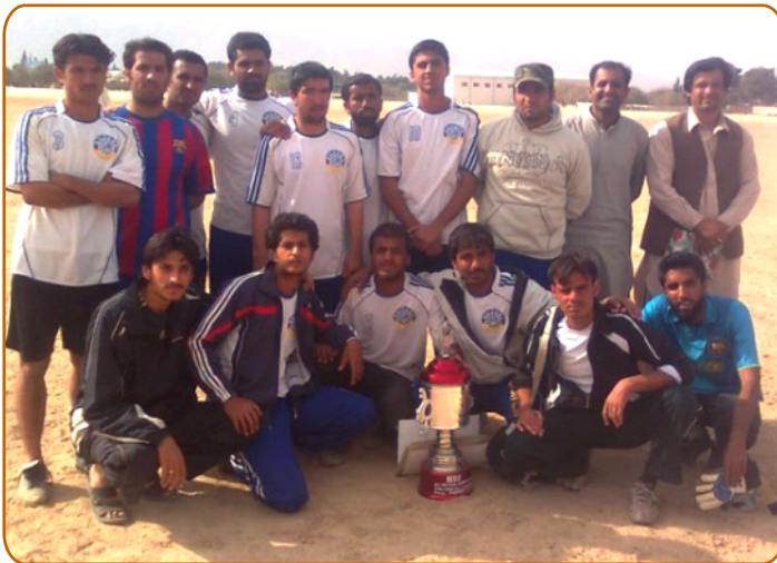
BUIITEMS Football team with zonal trophy.

The opening match of zone 1 was played on October 25, 2010 between LUAWMS and UoB, Quetta. The match ended in a 1-1 draw. In the second match, BUIITEMS defeated BUET, Khuzdar by 2 goals to one. The third match was between LUAWMS and BUET, Khuzdar. It also ended in a 2-2 draw. The match between Iqra University and Al-Hamd, University failed to produce any result.