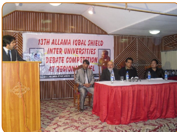
One of the debaters expressing his views.