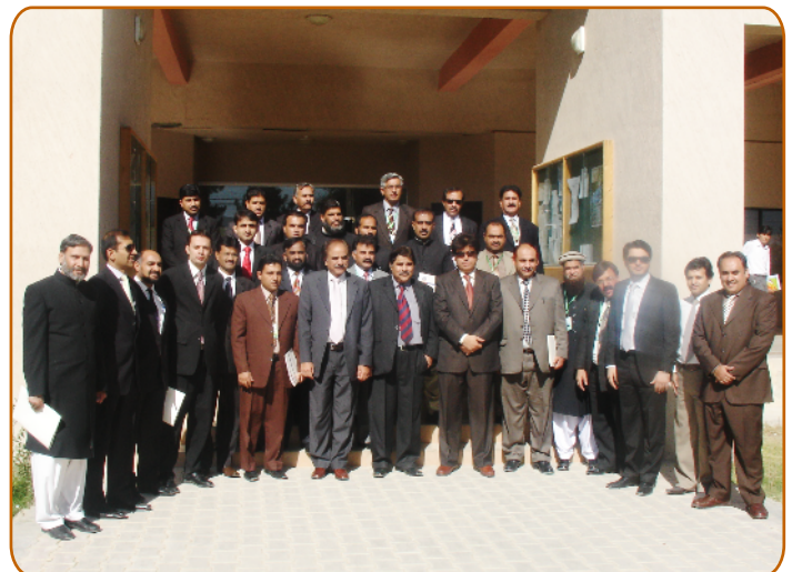
Group of visiting officers with VC, BUIITEMS