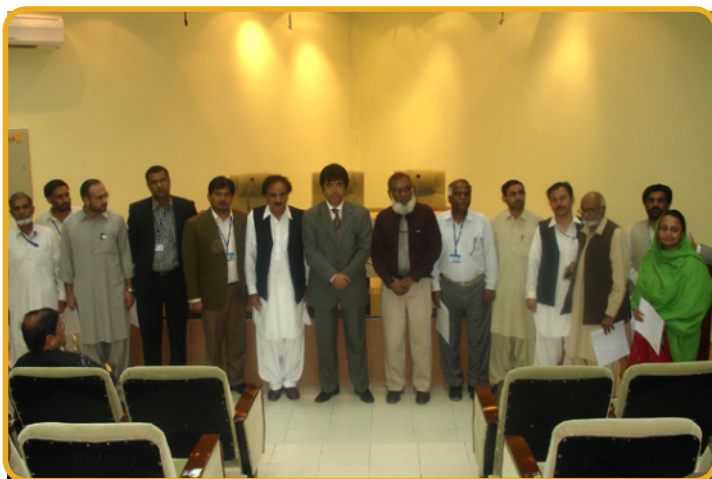
Internal Audit team with the Vice Chancellor.