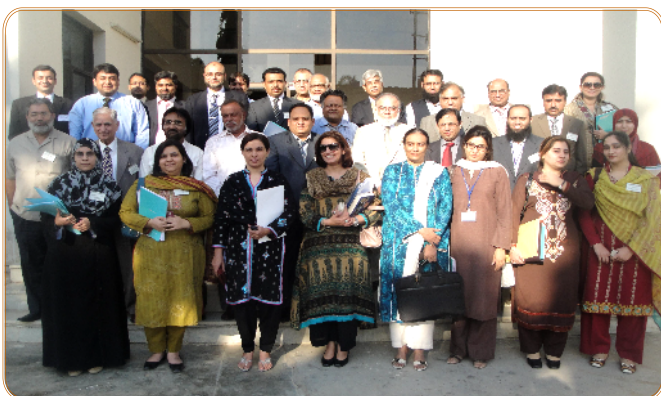
Group of NBEAC trainees.