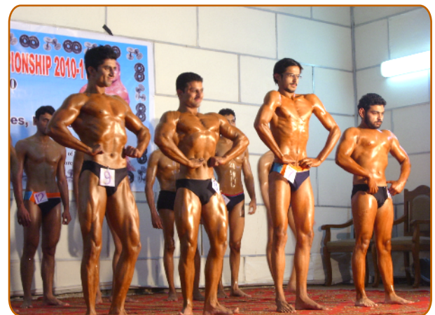
Body-builders posing on the stage.