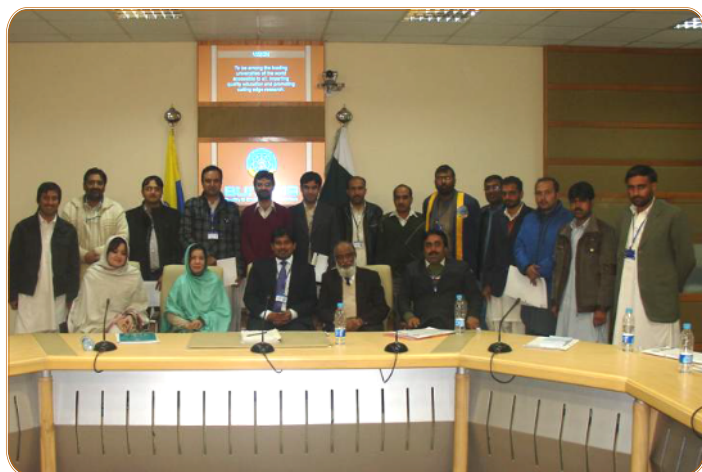
Group photograph of Workshop participants.