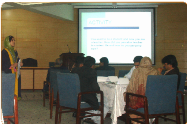
Orientation session in progress.