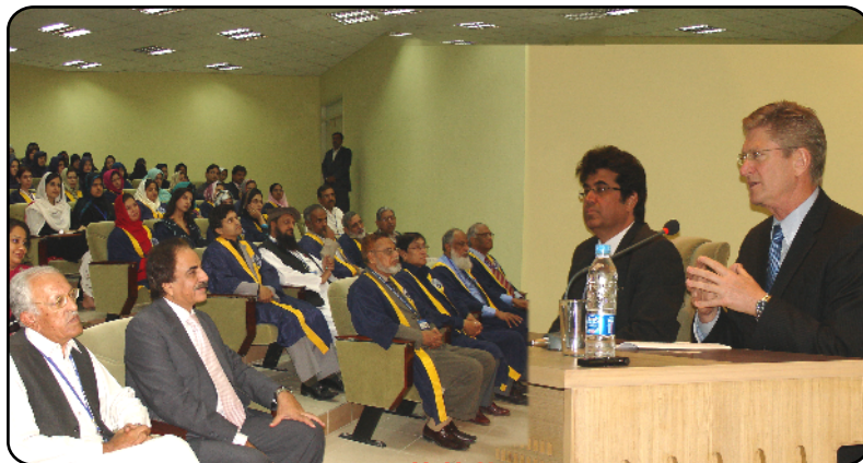
US Consul General talking to the audience