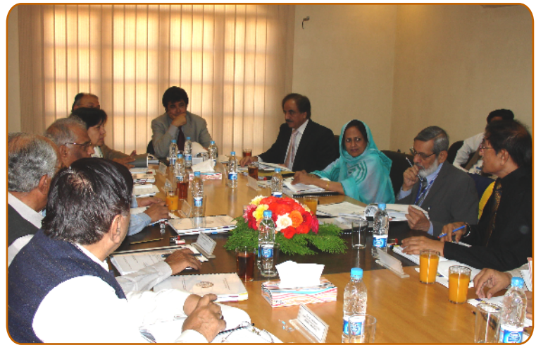
Meeting of BUIITEMS syndicate in progress.