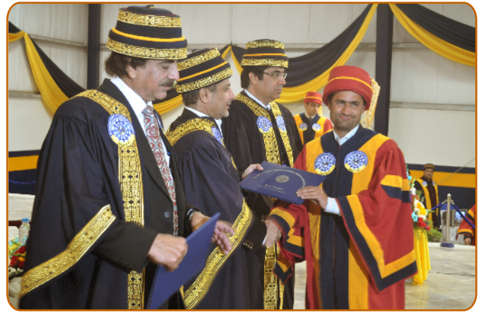
A graduate receiving his degree.

Degrees were awarded in: MS (Biotechnology & Informatics), MS (Computer Science), MBA, MBA (Banking & Finance), BS (Business Administration), BS (Economics), BS (Social Sciences), BS (Chemical Engineering), BS (Petroleum & Gas Engineering), BS (Textile Engineering), BS (Electronics Engineering), BS (Telecom Engineering), BS (Computer Engineering), BS (Computer Science) and BS (Information Technology).