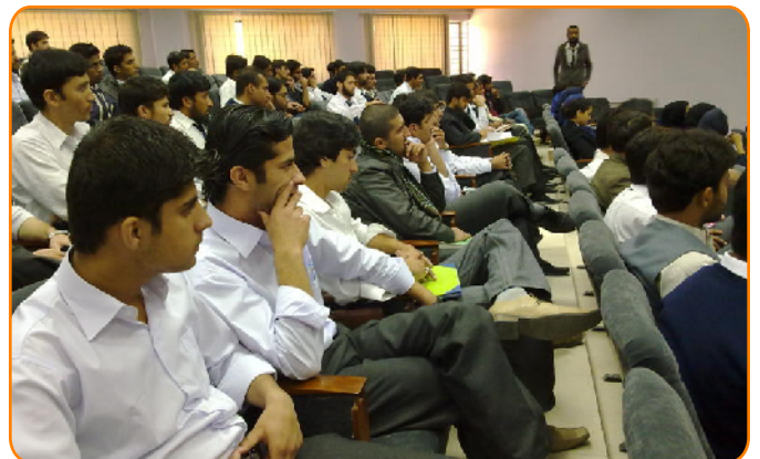
A section of audience at the seminar.