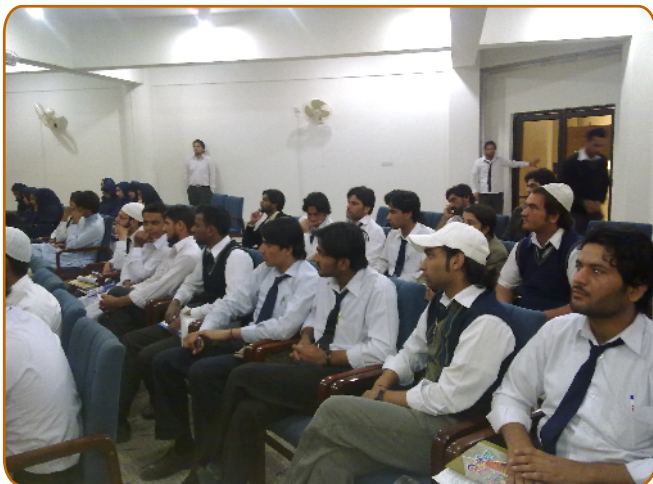
A section of the audience at the Qirat Competition

The contest was so close that it was difficult for the judges to assign positions. However, the following were declared to be the position-winners, in the long run.