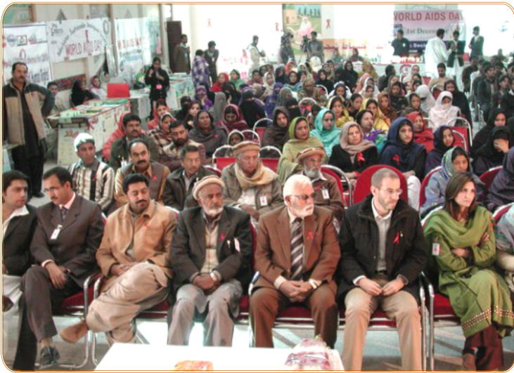
A section of audience of Anti HIV/AIDS function.