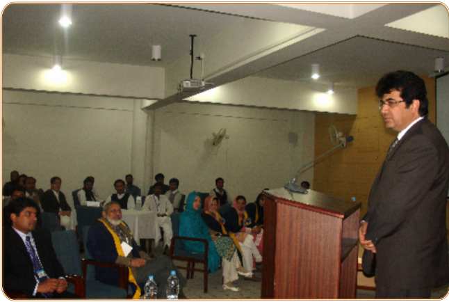
Vice Chancellor addressing the orientation session.