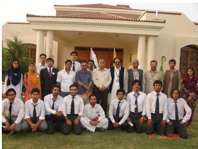
Pro.Vice Chancellor with participants of the talk show