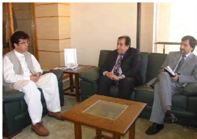
Honorable Vice Chancellor talking to Honorable Consul General of Afghanistan

BUIITEMS holds the honour of being an elite seat of learning in Balochistan, catering not just to the needs of students from this region but also of a substantial number of international students