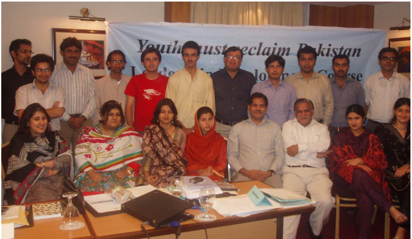
BUIEMS students with the organizers and participants of the course