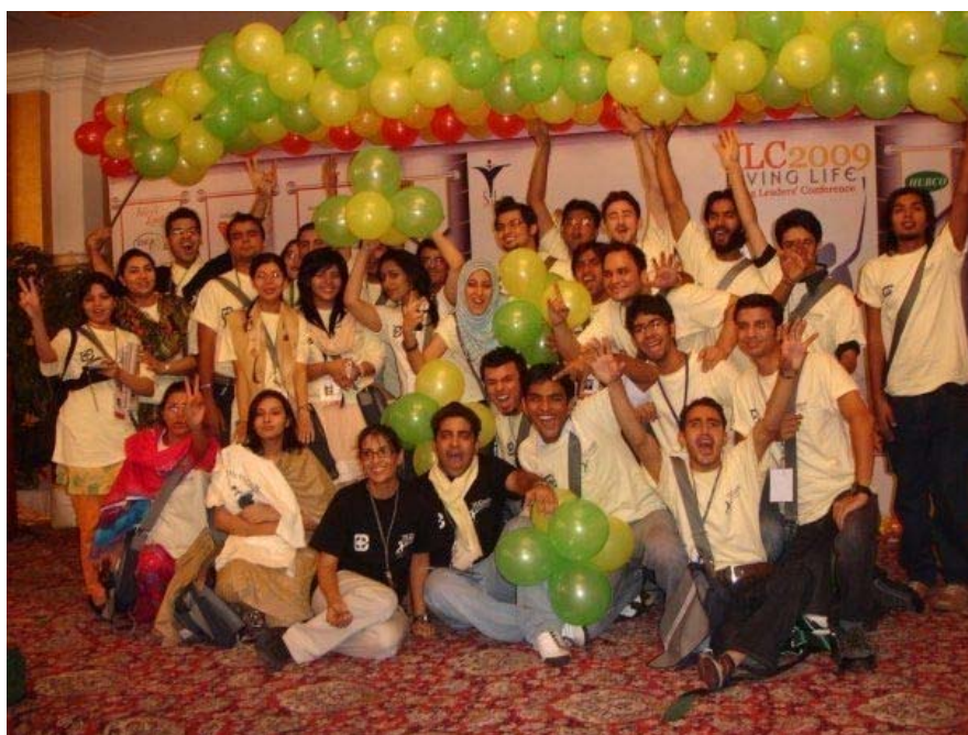
A group of YLC,2009 participants

In short YLC this year again gathered the youth, introduced them to leadership skills, competitive environment and guided them in the positive direction. The basic aim of this exercise was to inculcate the spirit of Self Development in youth, so that they could find out brighter ways of life for themselves and other fellow members of the society, as they are the Future Leaders.