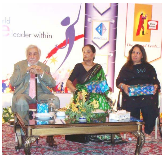
Mr. Cowasjee & Mrs. Zubaida Tariq on stage