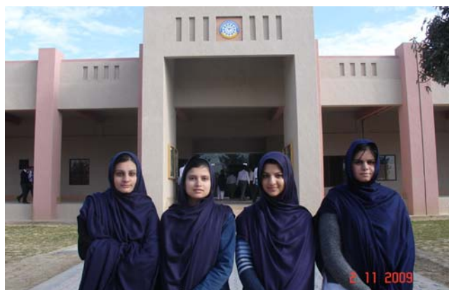
BUIITEMS WIEAG office bearers