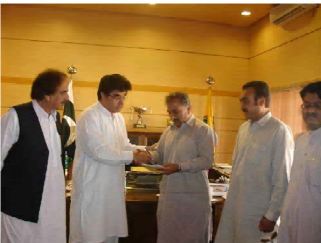
Honorable Vice Chancellor receiving cheques from Director, Baitul-maal