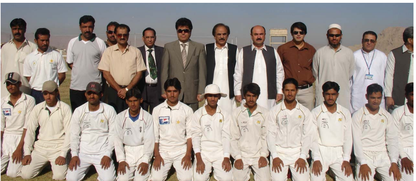
Honorable Vice Chancellor and sports officials with the visiting team