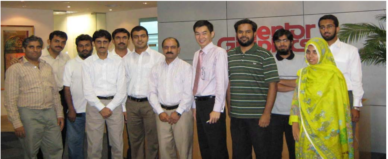
A group of EDA Tools Training participants at the Centre of Mentor Graphics, Asia in Singapore

Layout (SDL), rule writing, DRC and LVS verification through simulation (Calibre) and post layout flow (parasitic extraction and back annotation). PCB Design software training was spread over three days and covered options of the tools for drawing schematic, running Simulation (using Eldo) and drawing layout for the circuit.